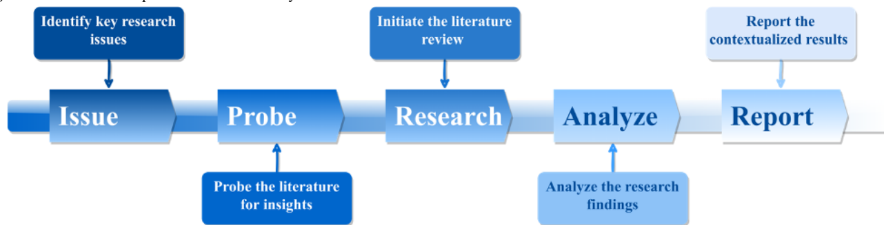
Figure 1. A schematic representation of the study framework.