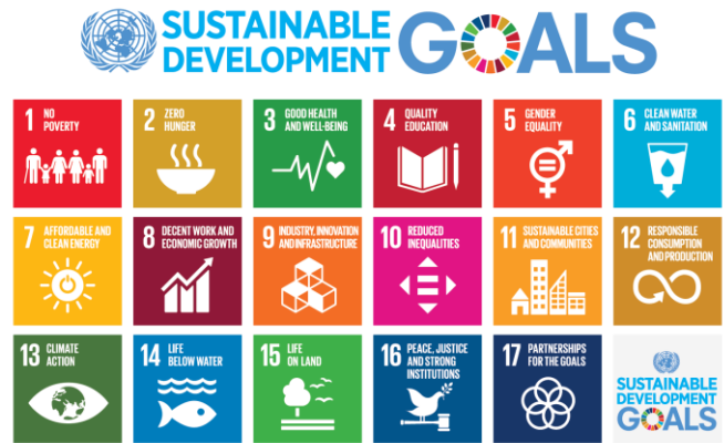
Fig. 3. A set of the Sustainable Development Goals introduced by the United Nations [12].

nanoplasmonic nucleotide sensors [33], the single molecule investigation with nanoplasmonic [34], the nanoscale transport phenomena in electronic thin films [35], the value of material science for nitride optoelectronics [36], and the printing of optical materials [37]. The diversity of the topics emphasizes how monumental is the field of nanotechnology and the need for comprehensive approaches towards education of nanotechnology.