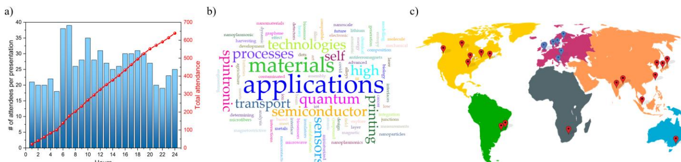
Fig. 1 a) Number of attendees and total attendance trend during the First Edition of the World Nanotechnology Marathon. b) Word cloud representation of the keywords from WNM titles and abstracts ( https://voyant-tools.huma-num.fr/ ) [9]. c) Geographical distribution of the speakers, based on their country of affiliation.