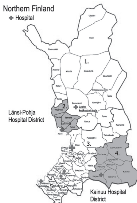
Fig. 1. Map of Northern Finland and study areas (II, published by permission of Wiley).