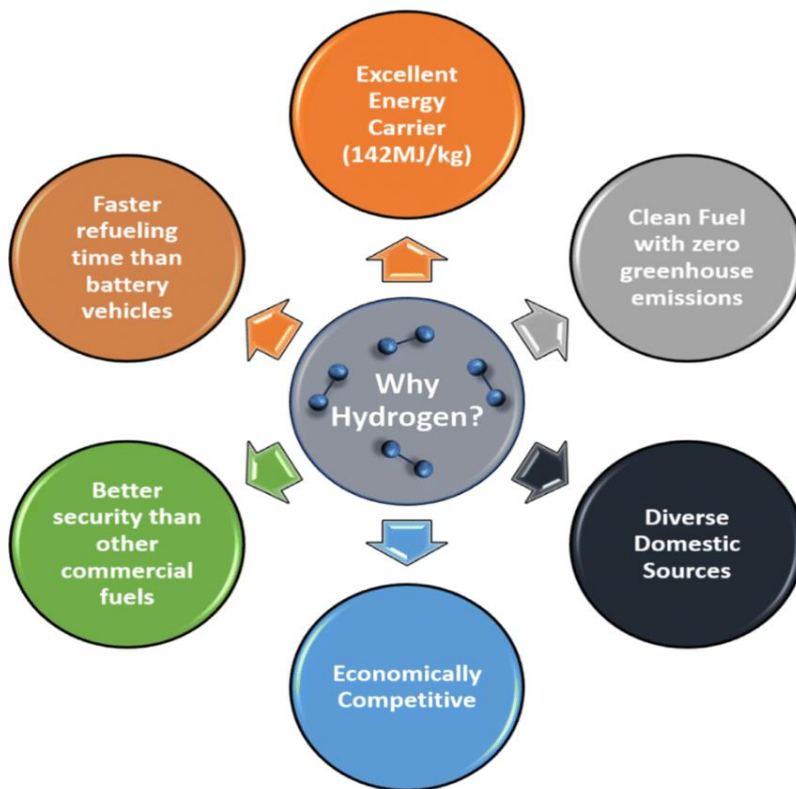
Figure 1. Advantages of using hydrogen as a fuel [1]