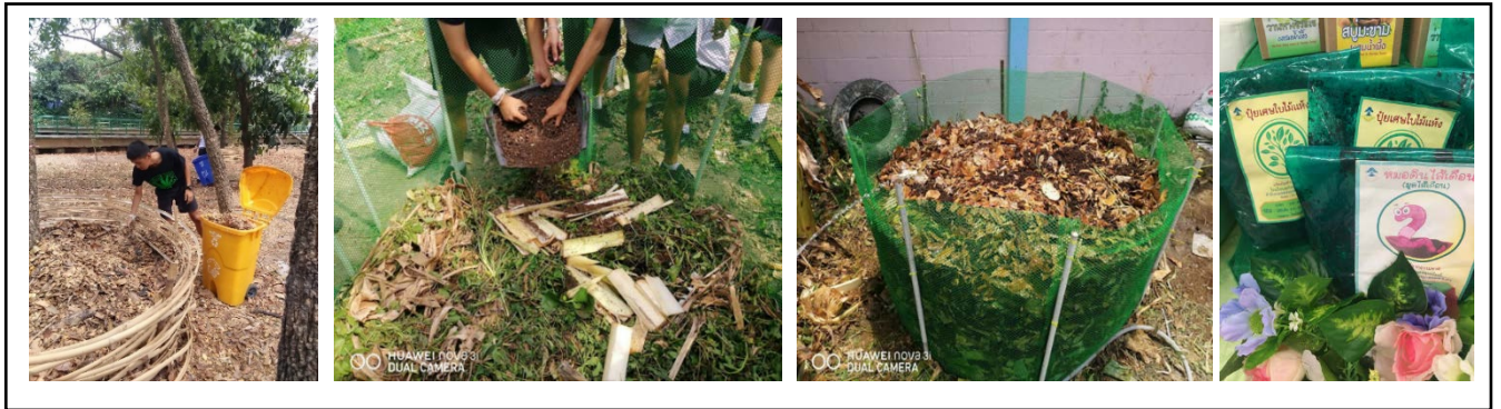
Figure 3: Science Experiment Dealing with Waste, and Fertilizer and Vermicompost Products