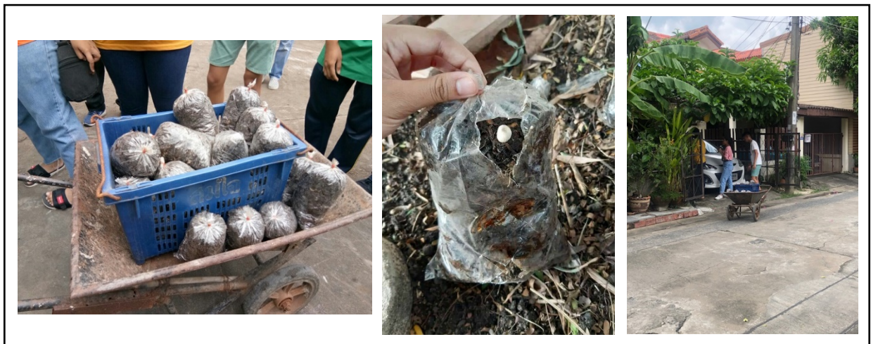
Figure 4: Science Experiment with Mushroom Cultivation and Community Engagement