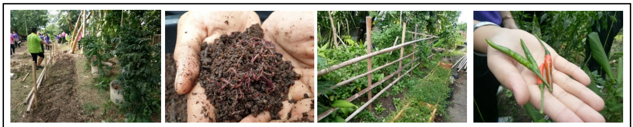
Figure 5: Science Experiments from Testing Various Types of Fertilizers and Vermicompost