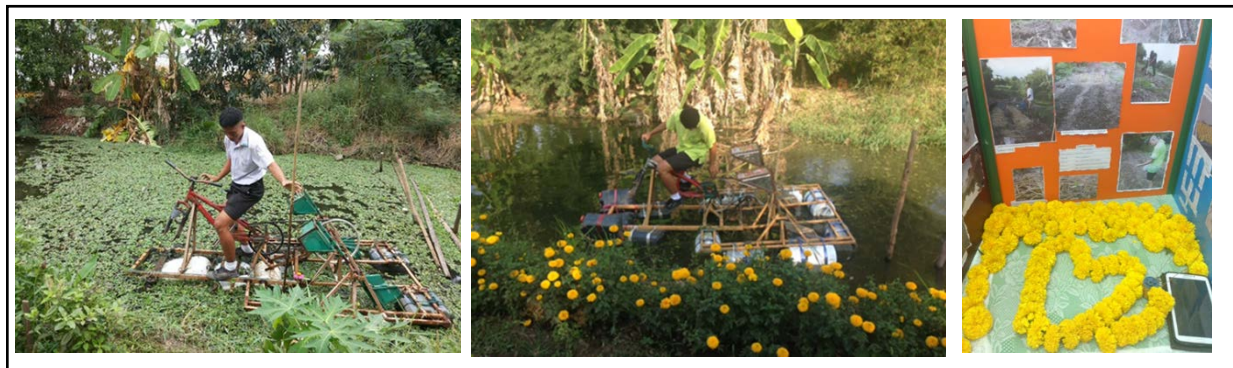
Figure 2: Integrating Physics, Chemistry, and Biology in Science Experiment When Dealing with Water Pollution and Marigold Flowers