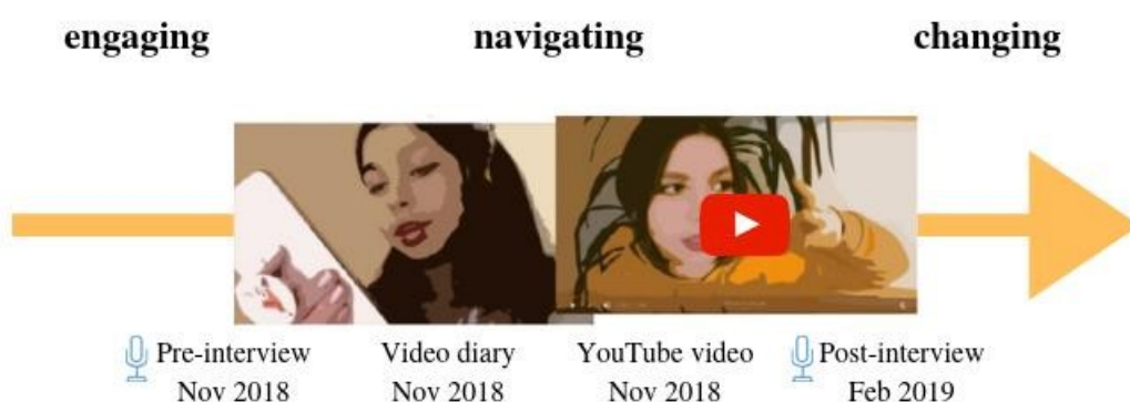
Figure 2: The central tasks of nexus analysis and timeline for data collection.

The navigation stage involved a more detailed examination of selected practices, discourses and social actions (Lane, 2014). Following Scollon and Scollon's (2004) suggestion to use different types of data, the video blogs Jane had published on YouTube were observed ('neutral' observations), she was interviewed (member's generalizations, individual experience and interaction with the member) and asked to create a new video about a health topic to her YouTube channel and record the process on a video diary ('neutral' observation) (see Figure 2).