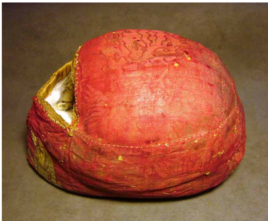
Fig. 1. The anonymous skull relic of Turku Cathedral before the scientific examination in 2011. The length of the object is 19.2 cm.