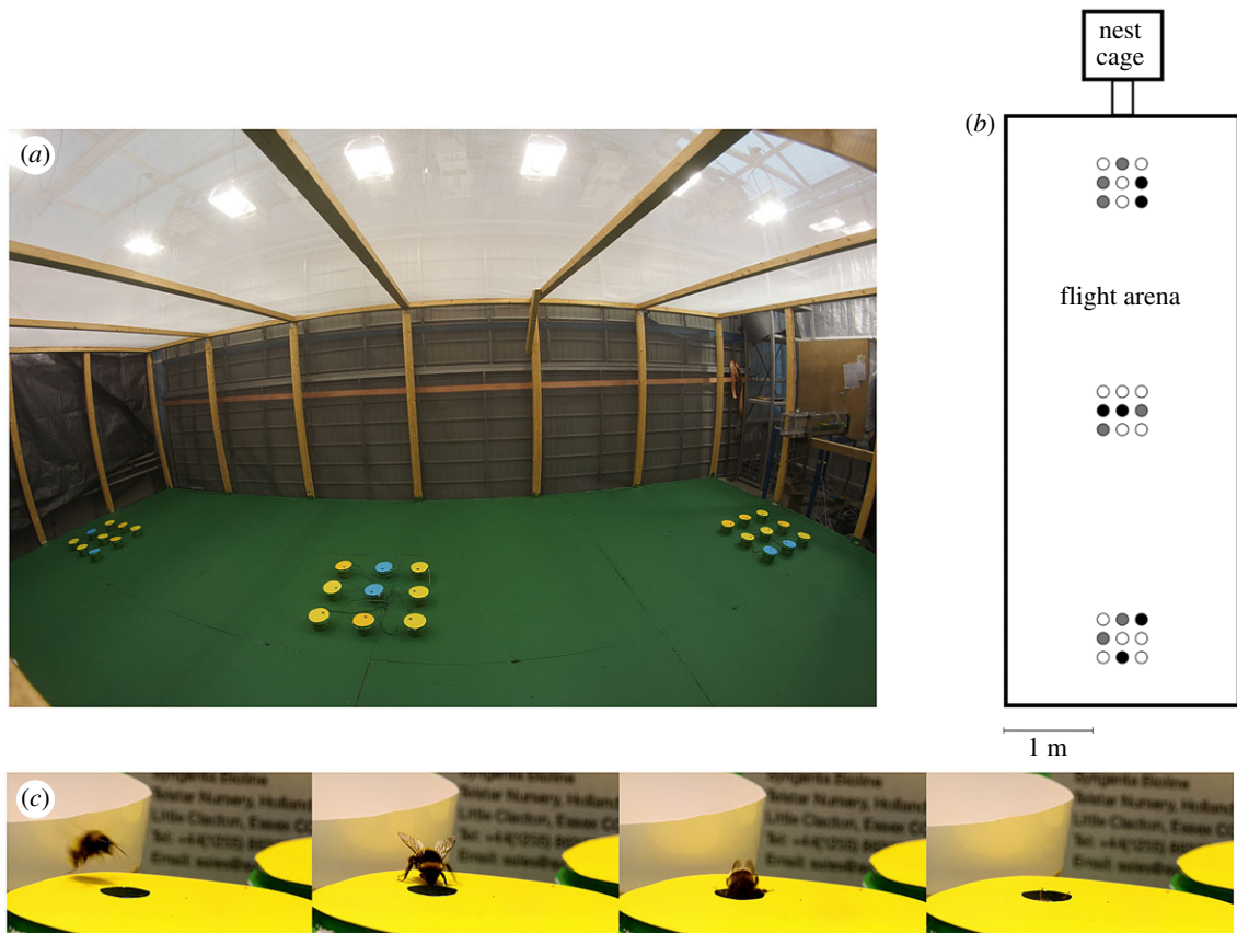
Figure 1. (a) Photograph and (b) schematic diagram of the experimental design of the flight arena used to quantify bumblebee foraging behaviour. Size of robotic flowers in (b) is only illustrative. White circles represent yellow (rewarding) flowers, while grey and black circles represent orange and blue (both punishing) flowers. (c) Time series photographs of foraging by a bumblebee on a robotic flower (during training in the nest cage).

subsequently stopped foraging and flying for a minimum of 5 min. The bumblebee was then removed from the flight arena (an individual bee was not used twice). Bumblebees had no prior experience of the flight arena (i.e. the spatial pattern of flowers in three patches) or of the punishing quinine treatment prior to data collection, but the three colours used there were also present in the nest cage.