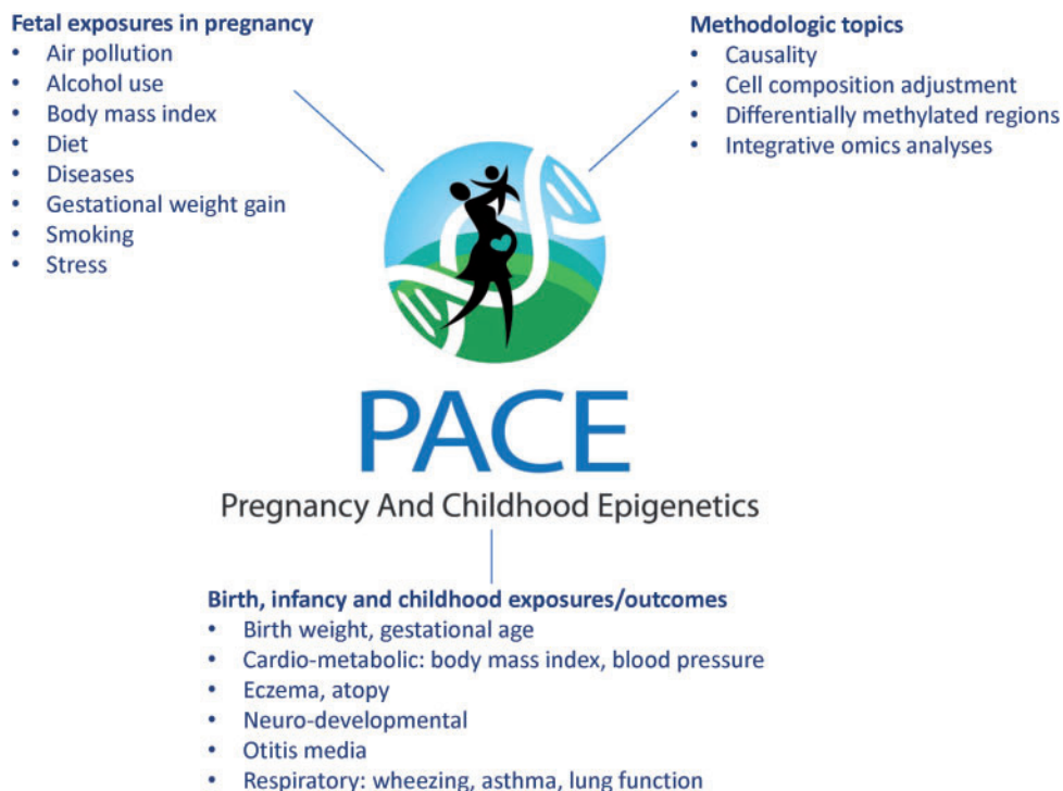
Figure 3. Current main exposures, outcomes and methodological topics in the PACE Consortium.

metabolomics if available, creating the possibility for integrative omics analyses. The availability of GWAS data enables analyses of associations of genetic variants with DNA methylation, as well as analyses to assess the potential influence of genetic variation on methylation variance, the possible causal role of DNA methylation differences using a two-step mendelian randomization approach, and adjustment for genetic markers of ancestry. 36–38